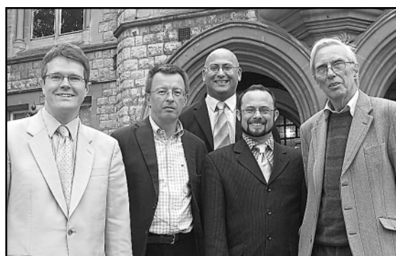
Lib Dem Group Outside Ealing Town Hall